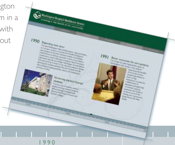
Move the green button through the timeline for a visual history of Washington Hospital Healthcare System.

The history of Washington Township Health Care District spans more than 50 years. It's the story of a community dedicated to bringing the world of excellent health care to its doorstep. You can experience this journey by accessing our interactive timeline, which includes numerous historical images. Just insert the CD into your personal computer and use your mouse to move through the years. A comprehensive list of historical events in our history is also available on the next page.